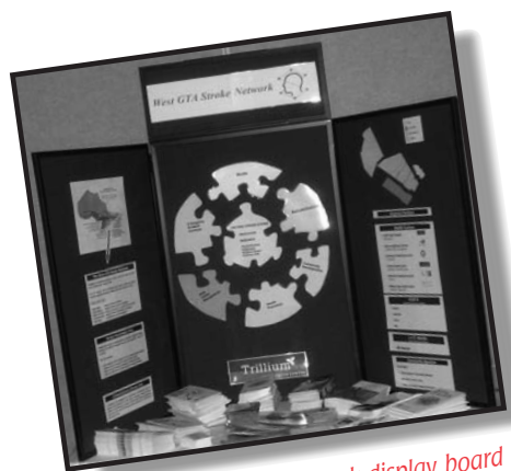
West GTA Stroke Network display board outlining our regional partners and the Trillium Regional Stroke Centre with HSFO resource materials

A portion of the Regional Education Learning Plan funds is available to support attendance at conferences or courses that are related to stroke. Interested clinicians are required to complete the Education Bursary Application and submit to the Regional Stroke Education Coordinator for consideration of funding.