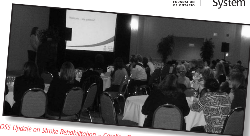
OSS Update on Stroke Rehabilitation – Caroline Gangji Stroke Rehab Symposium Jan. 2007